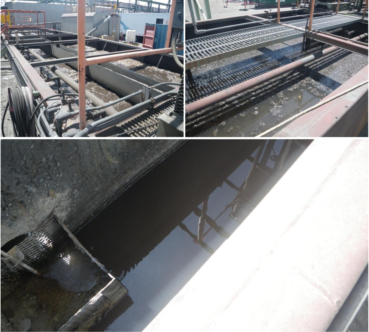
Figure 13: Domestic wastewater treatment package plant; final effluent (bottom) murky.