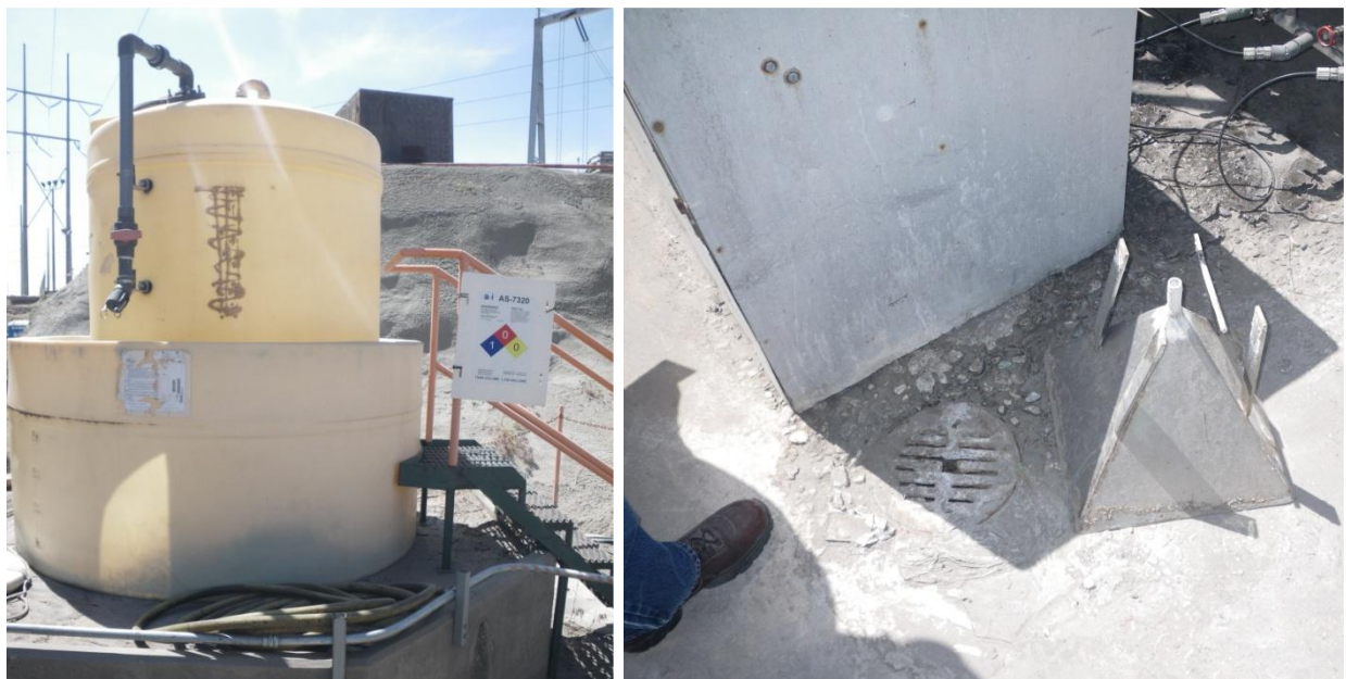
Figure 11: Corrosion inhibitor, acrylate copolymer (left) and chlorine powder addition (right).