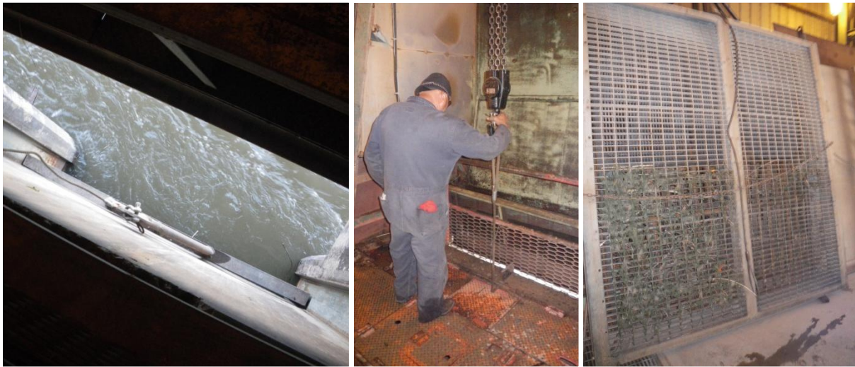
Figure 24: Intake screen before, during and after daily removal and replacement.