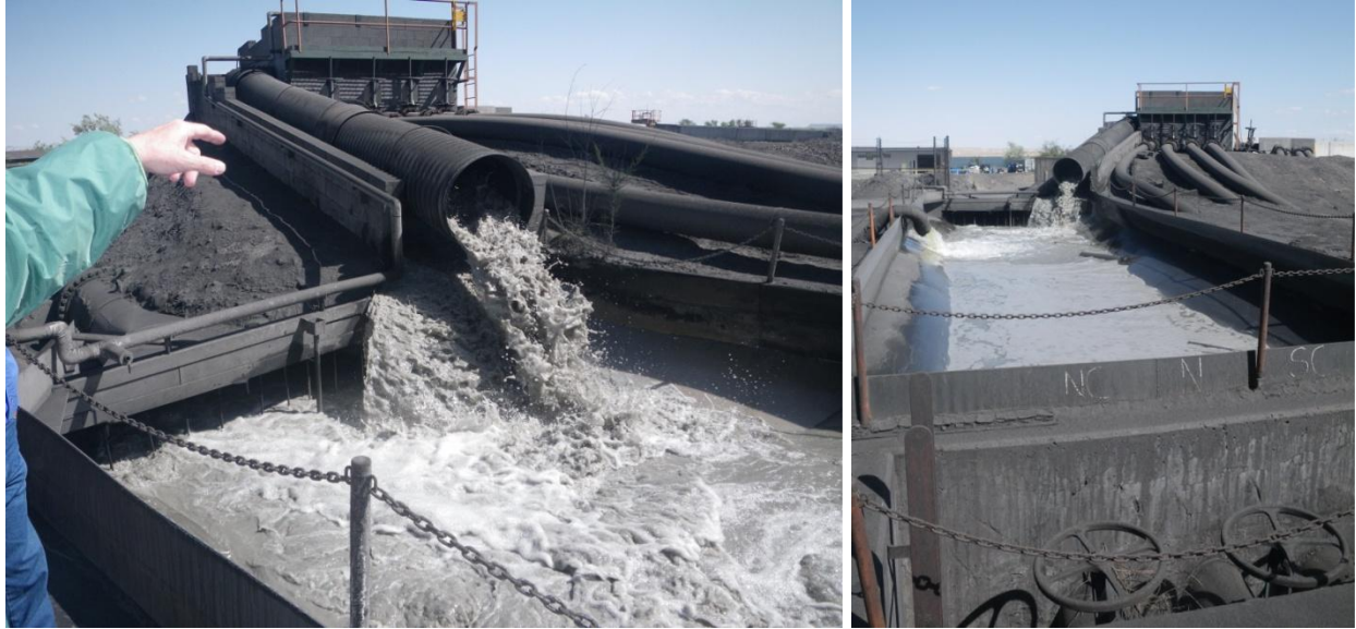
Figure 2: Sump pumping drainage from facility to Combined Waste Treatment Pond (CWTP).