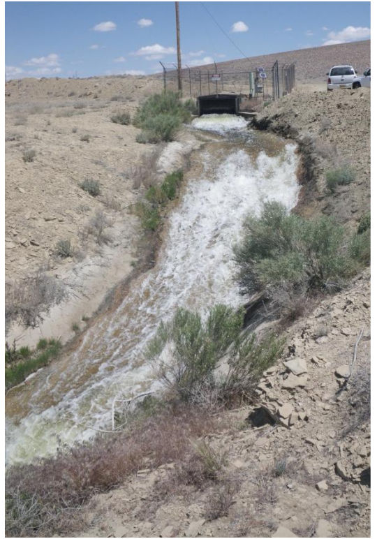
Figure 20: Outfall 001 from Morgan Lake to No Name Wash.