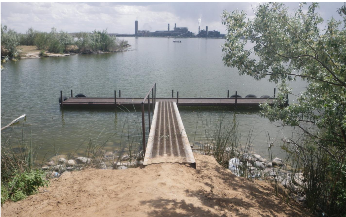
Figure 25: Morgan Lake. Above: Residences on left within 2,000 feet of lake. Below: Publicly accessible dock and fisherman in lake.