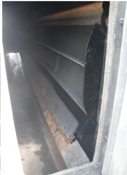
Figure 9: Cooling water intake channel and screens for units 4 and 5.