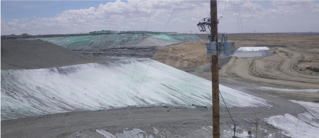
Figure 19: Fly Ash Pile (back) next to single-lined pond (left) with dust-suppression (white) and pH adjustment (green).