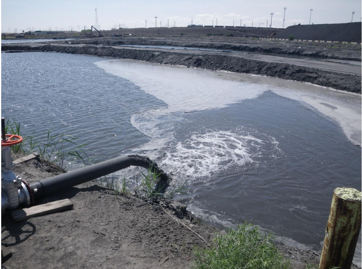
Figure 4: Influent to CWTP