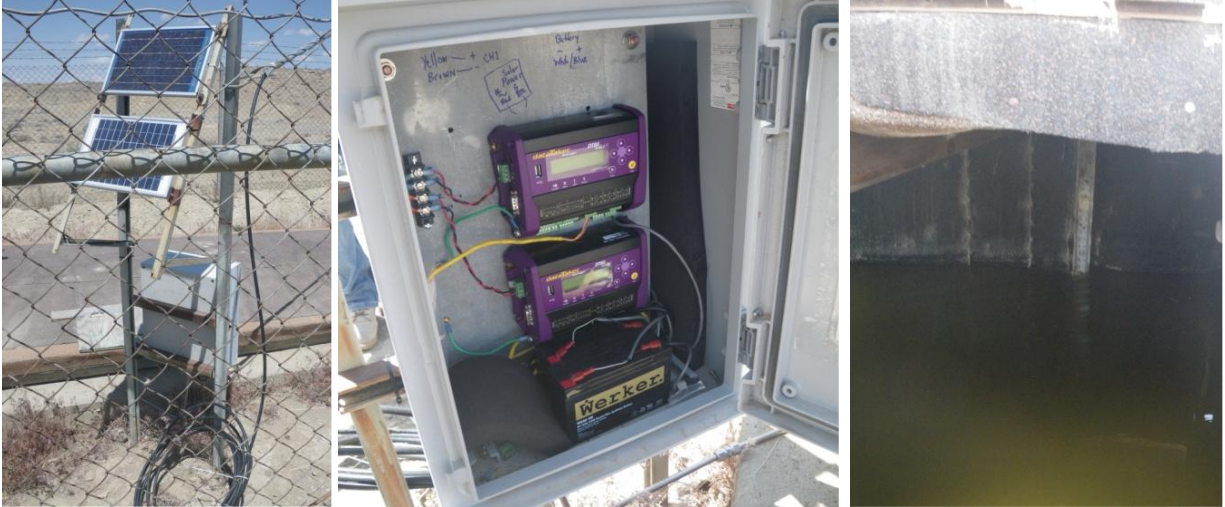
Figure 21: Temperature meter and log and flow gage at Outfall 001.