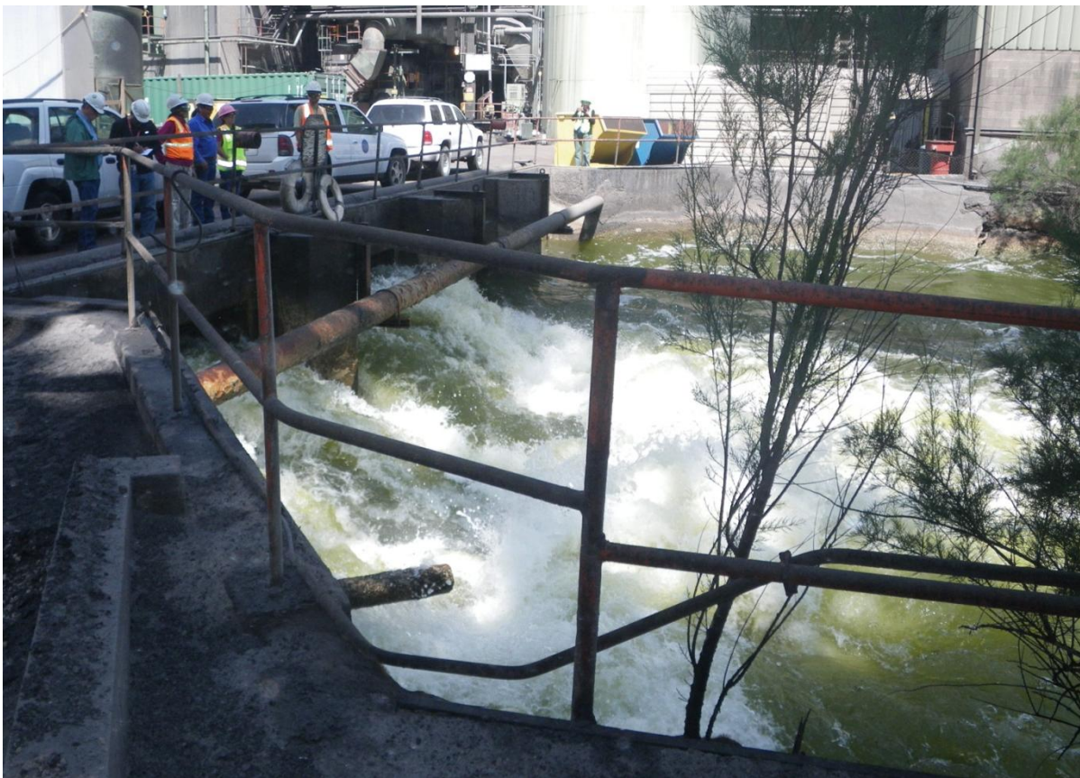
Figure 12: Cooling water discharge from unit 4; unit 5 not discharging at time of inspection.