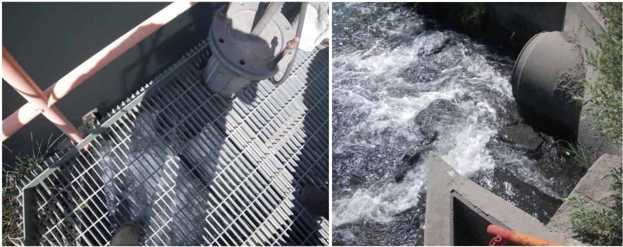
Figure 7: Flow from CWTP metered (left) goes through culvert before discharging to cooling water effluent canal (right).