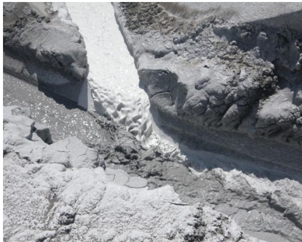
Figure 15: Thickener from blowdown (left stream) and underflow sulfate/sulfite solution (right).