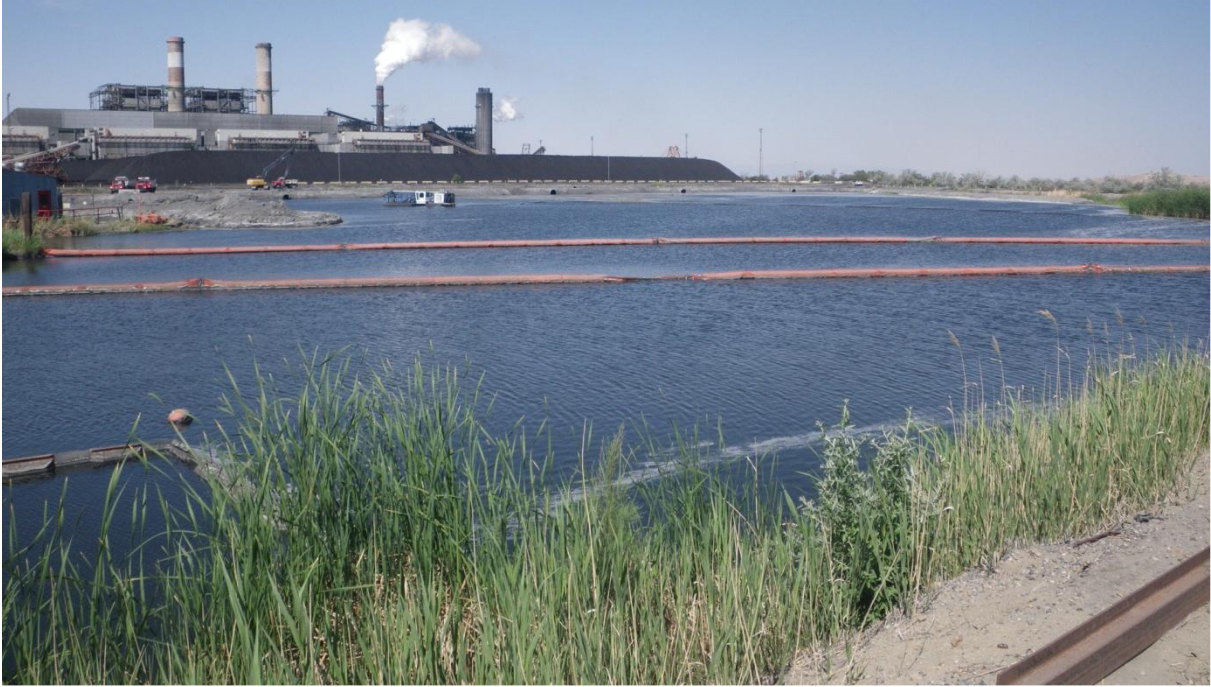
Figure 6: CWTP with berming to control flow and skim grease before outfall (bottom left).