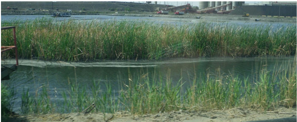
Figure 5: CWTP with oil along bank.