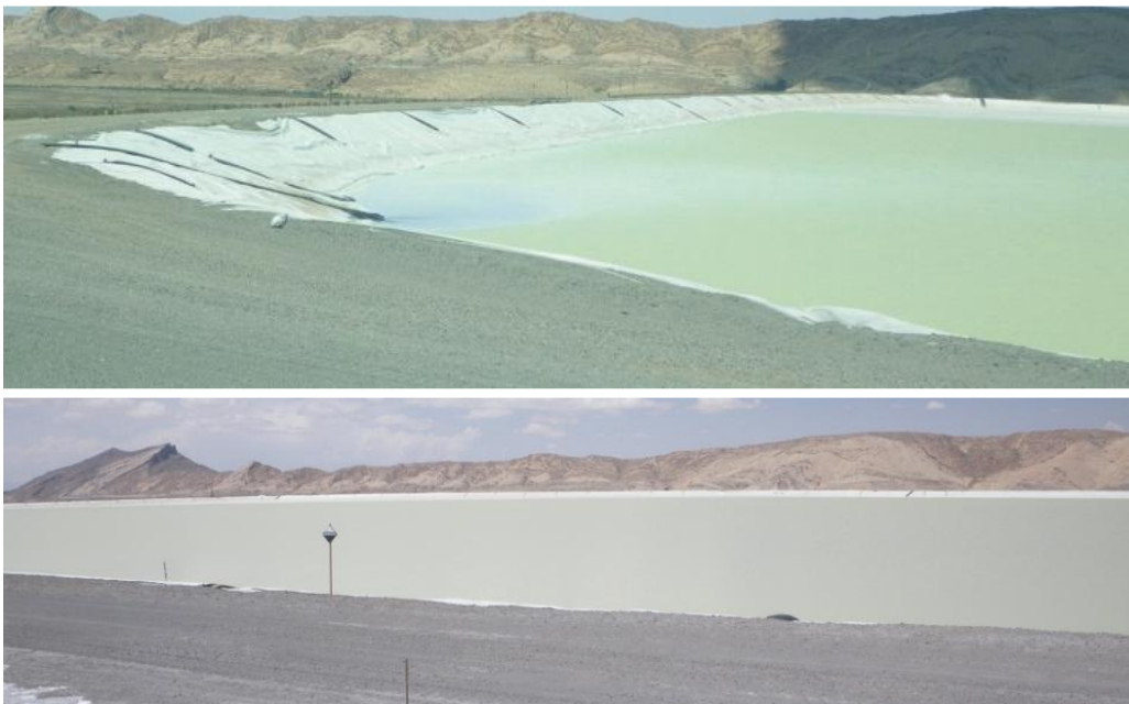
Figure 17: Double-lined fly ash pond; influent from single-lined pond (above).