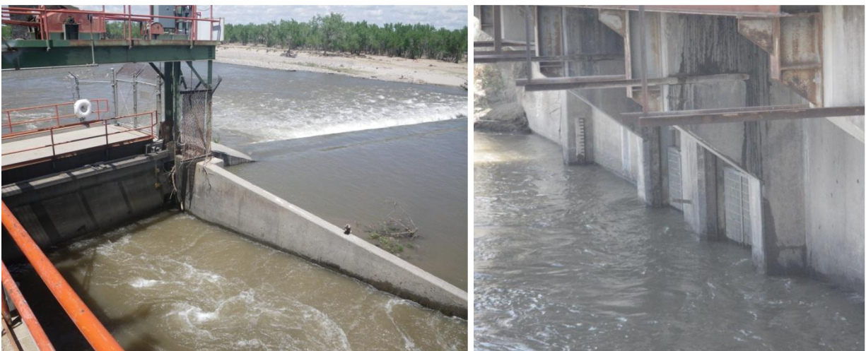
Figure 23: Diversion structure and intake screens along bank of San Juan River.