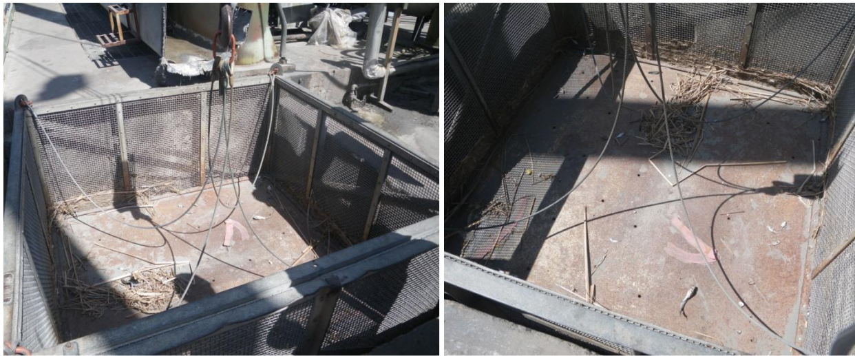
Figure 10: Fish return from traveling screens disposed of once/day. Approximately 12 fish between 1" and 6" observed in basket.