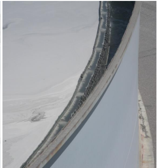
Figure 14: Thickeners from blowdown to be sent to fly ash ponds.