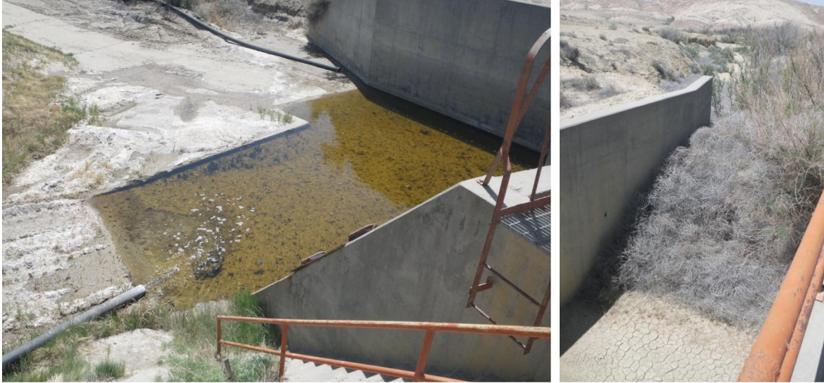
Figure 18: Fly Ash Pond seepage intercept with former leachate outfall (right).