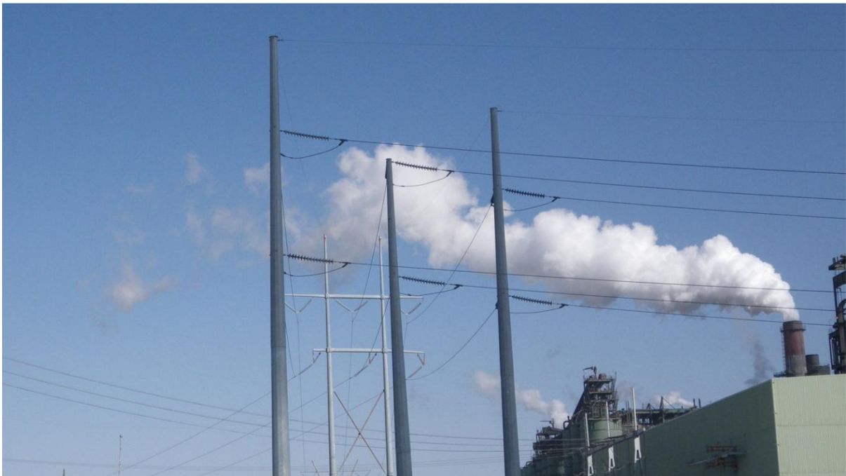
Figure 1: APS Four Corners Power Plant. Close up of plume coming off unit 3.