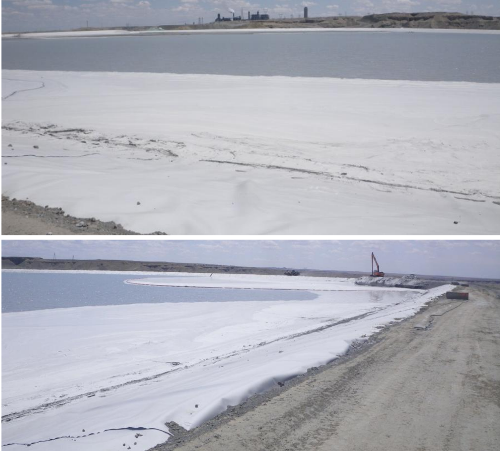
Figure 16: Single-lined fly ash pond. Floatables removed (bottom) and sold.