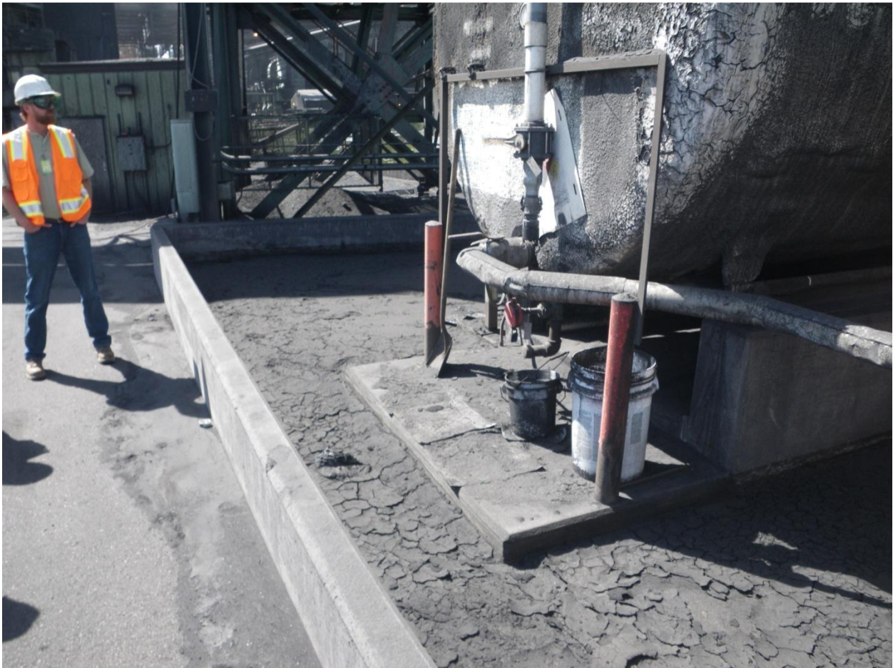
Figure 3: Flocculant for sump with containment. Ash build-up prevalent on the premises.