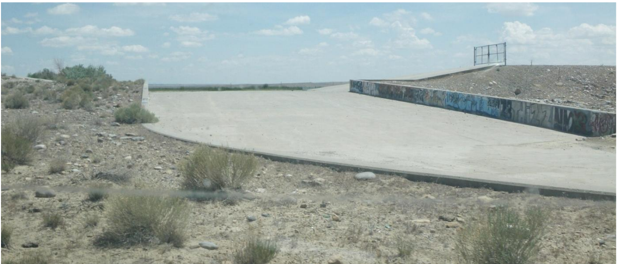
Figure 22: Morgan Lake Spillway.