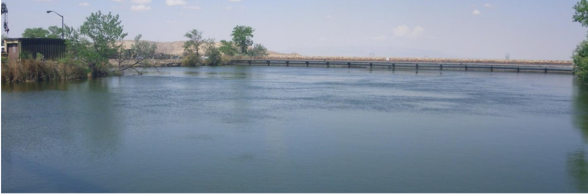
Figure 8: Berm wall before intake channel to draw only bottom water from Lake Morgan.